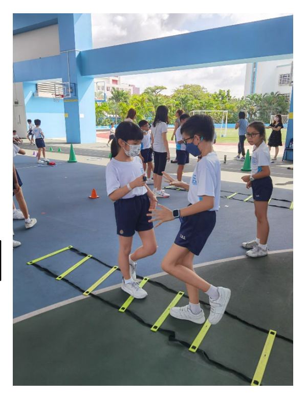
Holistic Health Festival