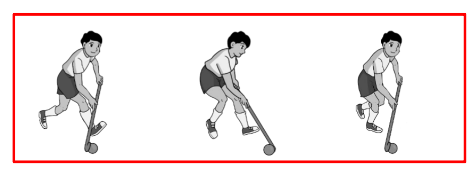
Dribble with long-handled implement

Assessment for PE will consists of a combination of formative and summative assessments to help student learn and grow holistically.